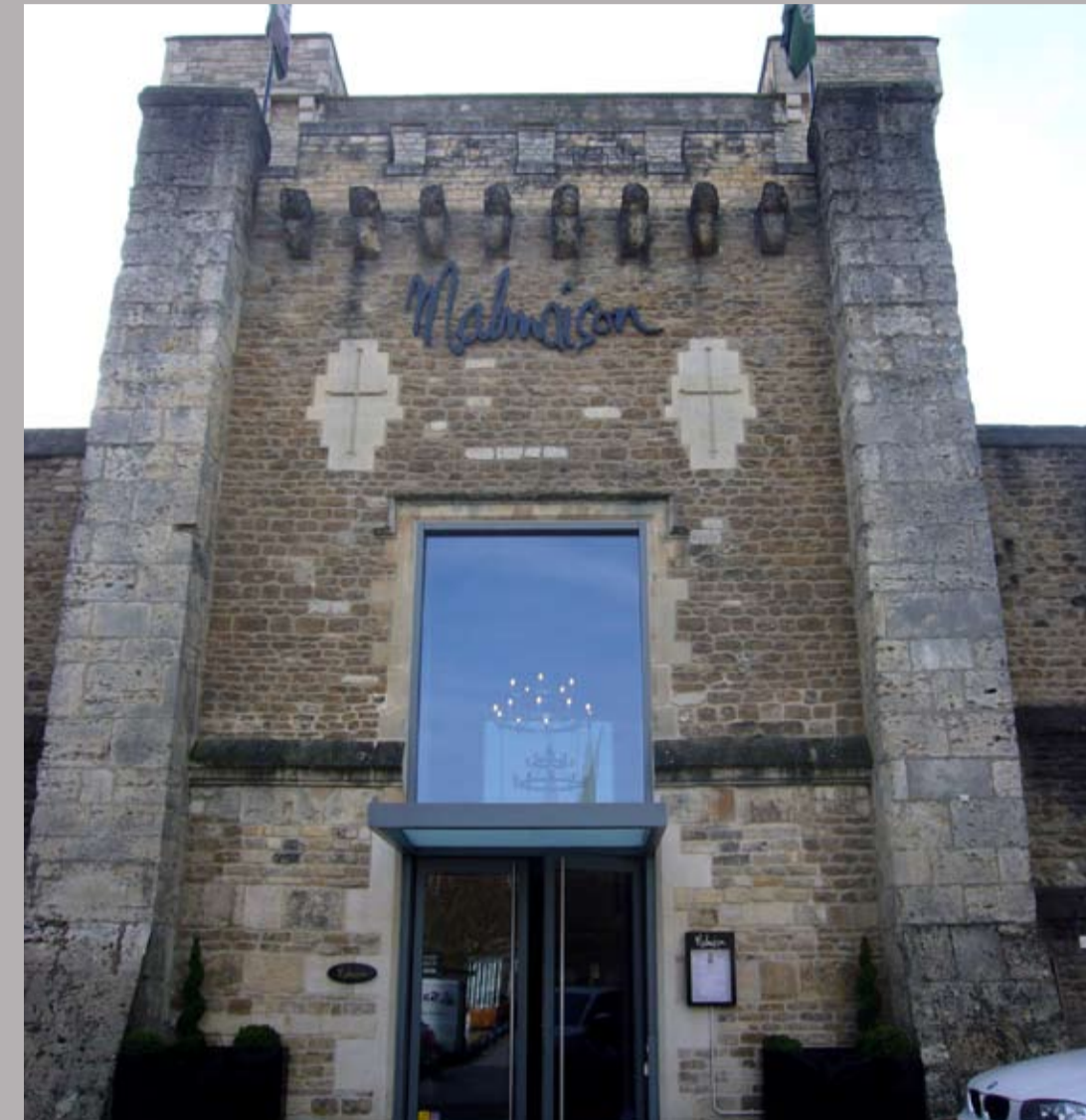
Photos, left to right: our lemon, carrot and chocolate cupcakes in silver foil cases with silver hearts with a top cake with a silver organza ribbon; interior of the former prison where rows of cells above and below the walkway are now upmarket bedrooms (many famous people have stayed there including Robert Redford); Above, wedding reception room; front view and entrance of the Malmaison Hotel.